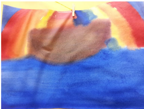
Third Grade Painting