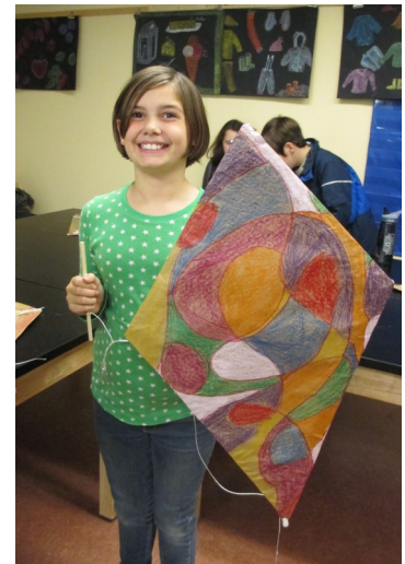
Fourth Grade German Class