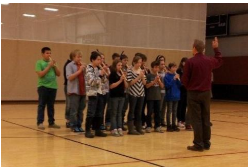
Seventh Grade Flutes at the Assembly