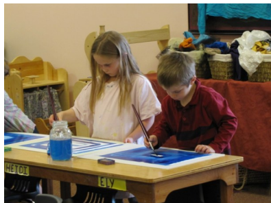
First Grade—painting day