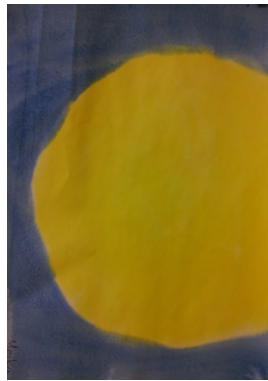
First Grade Painting