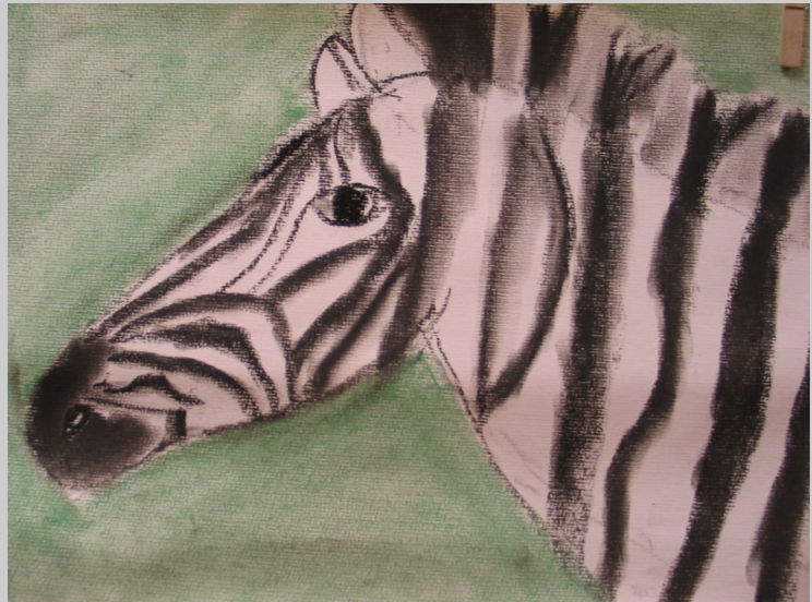
4th Grade Art / animal studies