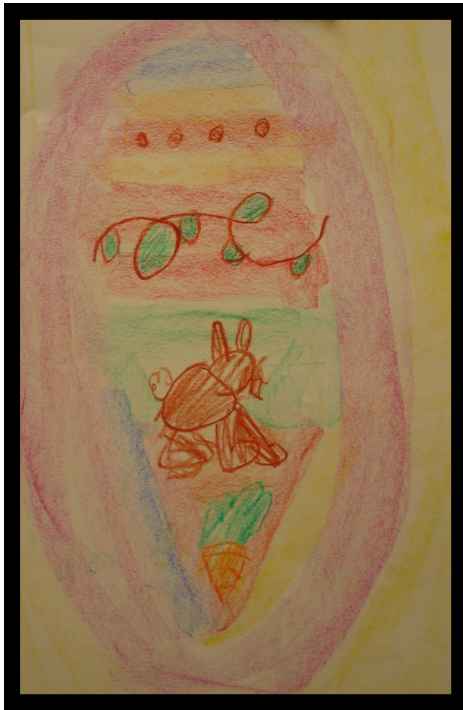
1st Grade Art