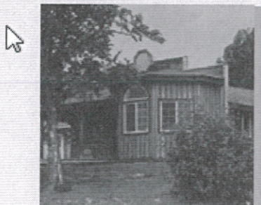
Thoughtful Therapies Homer, Alaska