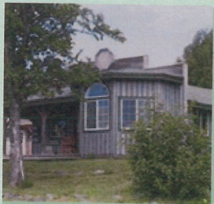
Thoughtful Therapies Homer, Alaska